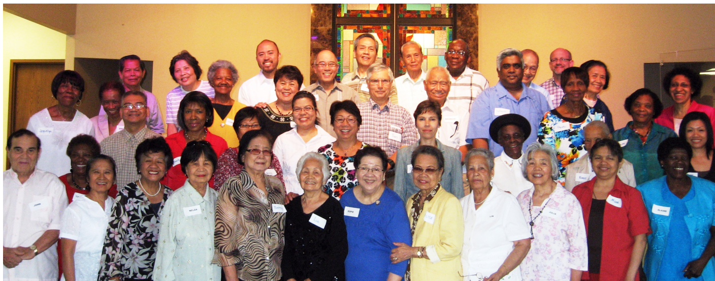
SENIORS GROUP REPRESENTING FOUR CHURCHES