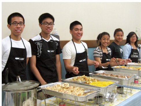
YOUTH HELPED SERVE LUNCH

It is good to have fellowship with other sisters and brothers; to experience what God is doing in their hearts and lives, as we can share what God is doing in our lives and in our midst. So what can we say but, "TO GOD BE THE GLORY, GREAT THINGS HE HATH DONE."