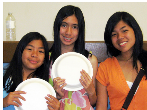
ADDITIONAL HELP FROM THE GIRLS